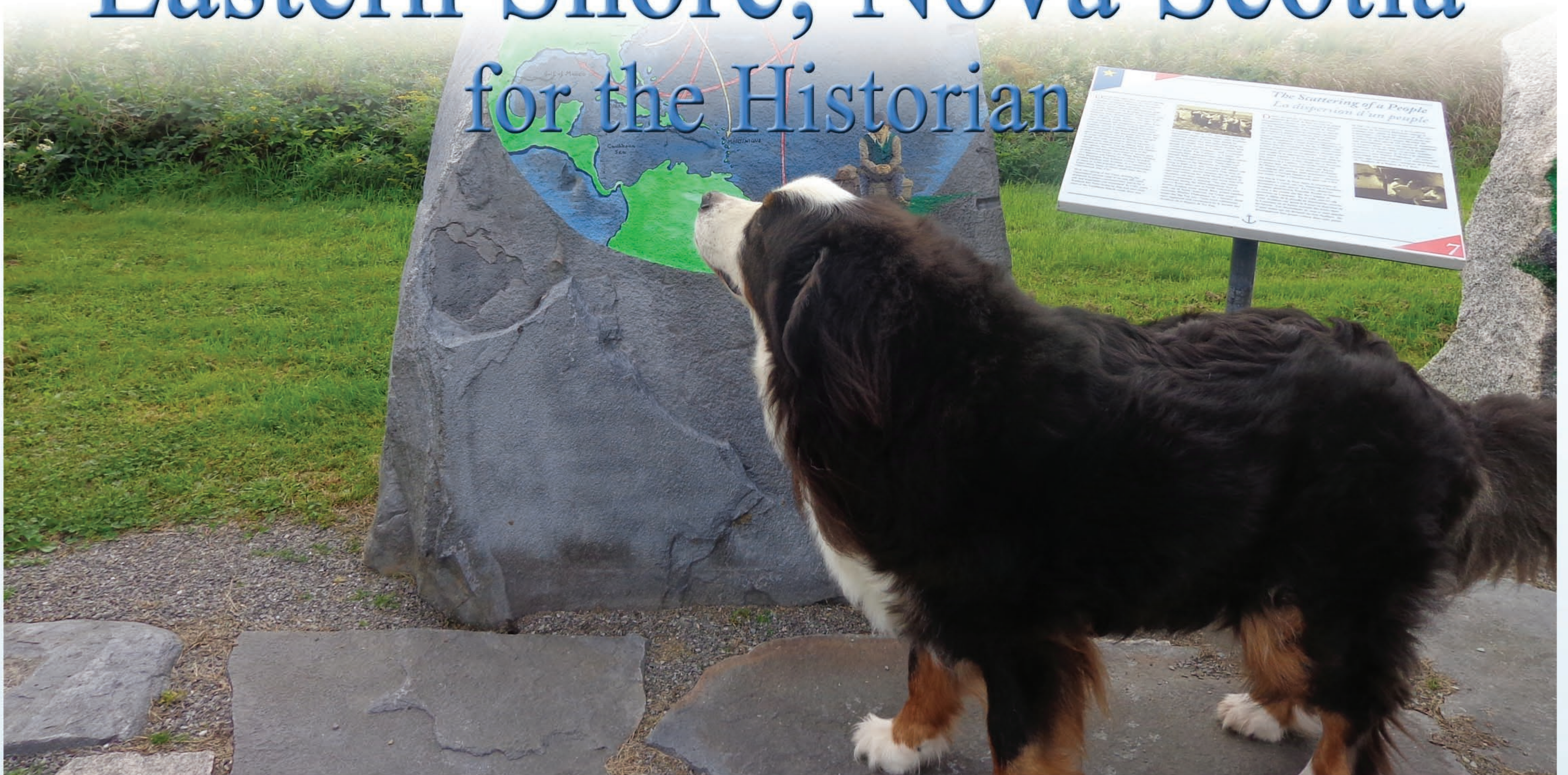
Beaufort the inn dog reflects on the Acadian history of the area

IMAGINE a day where you are moved by the history of the local Acadian people; your heart is warmed by stories of lighthouse keepers of old; you walk in the footsteps of 16th century settlers. Here at the far end of the Eastern Shore, that day can be yours.