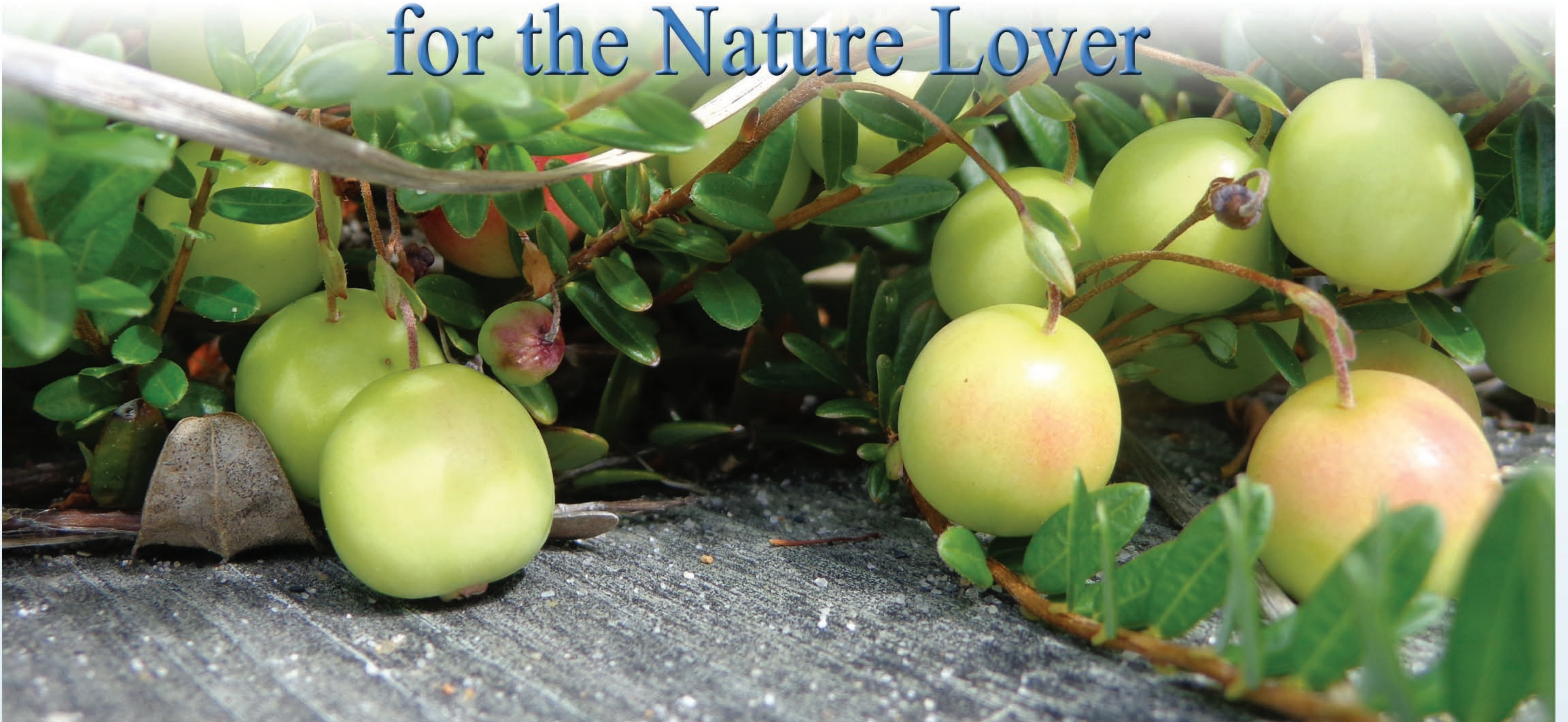
Cranberries growing by the boardwalk in Tor Bay

IMAGINE a day where you can wander for hours and not see another soul; fresh berries are yours for the picking; and Mother Nature's handiwork sculpts the land around you. Here at the far end of the Eastern Shore, that day can be yours.